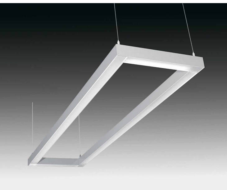
WEGA-FRAME-I / WEGA-FRAME-J