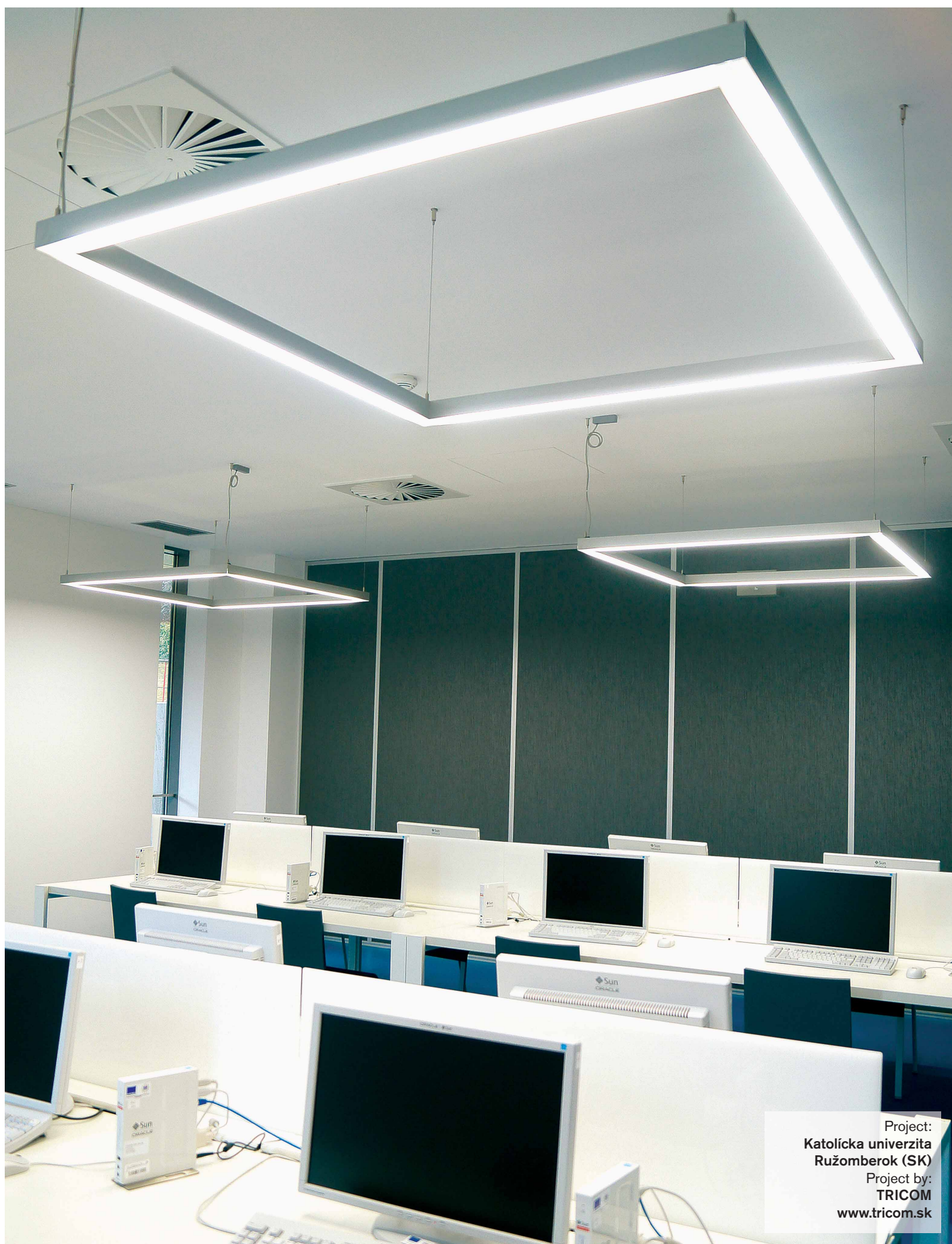
Project: Katólicka univerzita Ružomberok (SK) Project by: TRICOM www.tricom.sk